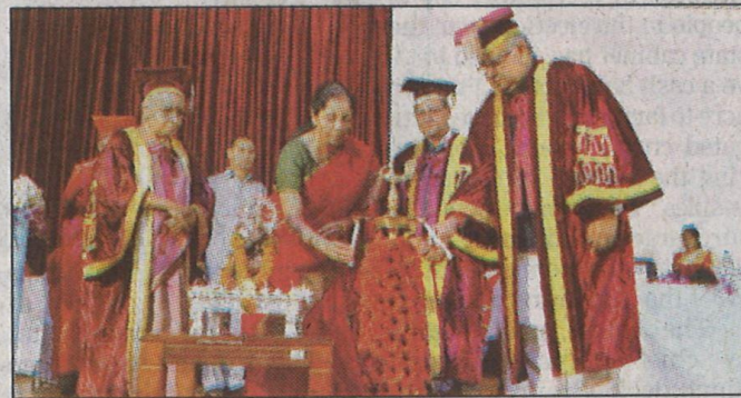
(Above) 2018 graduating class of IIM-Raipur. (Below) Defence minister Nirmala Sitharama and chief minister Raman Singh lighting the ceremonial lamp during the convocation

men participation as well as of the students who come from various academic backgrounds.