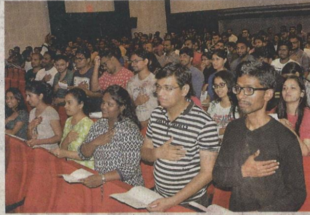
Students taking part in the rehearsal on Monday for the 7th convocation ceremony of IIM- Raipur to be held on Tuesday.